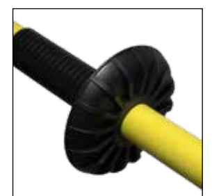
Protective Hand Grip